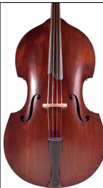
Moses A. Tewkesbury, NH 1844

(212) 239-3333 ● (718) 451-8800 ● www.CCrentalNYC.com